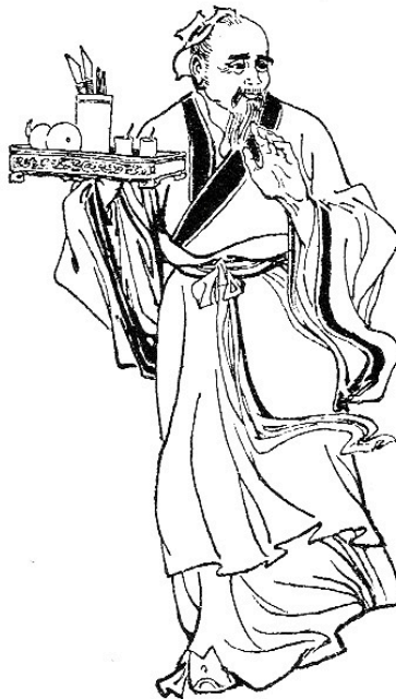
陀 華 Hua Tou

Is there a utilization review process (UR) required?